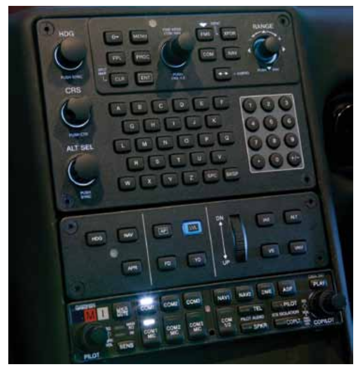
Recent trends toward larger, FMS-style keyboards (and fewer multifunction keys) hold promise for easier data entry and quicker transitions to new equipment.

But there's a caveat here, one that points to the reason it's becoming more difficult to talk about "GPS" in a monolithic sense. You might be able to use a Garmin GNS-530 (a GPS/NAV/COM unit) for that VFR flight without much preparation or training...but it wouldn't be smart to try the same thing with its big brother, the G-1000. The G-1000 has a built-in GPS receiver, but it's also a full glass panel system that replaces the traditional