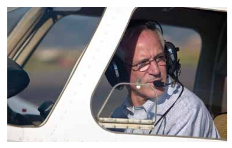
During taxi, keep your eyes where they belong—outside the cockpit.

Dangerous Distraction. The following account is taken from an actual report to the Aviation Safety Reporting System: "I had touched down, after making three calls on approach, only to have a Bonanza almost taxi onto the active runway to back-taxi for takeoff. He stopped with his propeller approximately three feet from the runway's west edge. He indicated he was 'messing with his GPS' and not watching. The truly sad situation is there is a parallel taxiway to take him to [Runway] 16 without having to back-taxi on the runway."