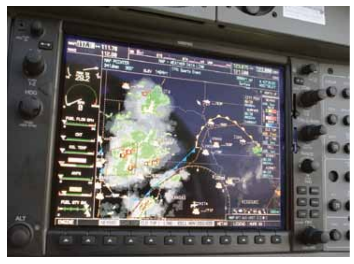
From datalink weather and traffic information to 3-D synthetic vision systems, more and more functionality is being bundled around GPS.

Every GPS receiver does exactly that—no more, no less. Some are a little faster than others, and some can use correction signals from ground stations to produce a more accurate position fix, but they're still spitting out a latitude, longitude, altitude, speed, and direction.