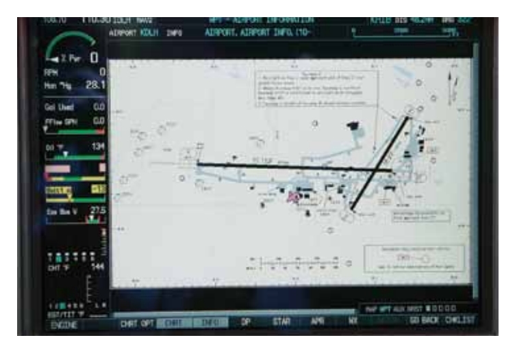
Electronic chart displays can be very helpful in the cockpit, but it's still a good idea to have paper charts available.

Pilots who have multifunction displays (MFDs) or electronic flight bags (EFBs) capable of displaying electronic charts often ask whether it's still necessary to carry paper charts. The answer? Although there's no specific legal requirement to carry current charts and approach plates, the FAA could, again, potentially cite the pilot for failing to become familiar with all available information concerning the flight. For that reason—and because charts, unlike electronic displays, never "crash"—ASF recommends having current paper charts available in the aircraft.