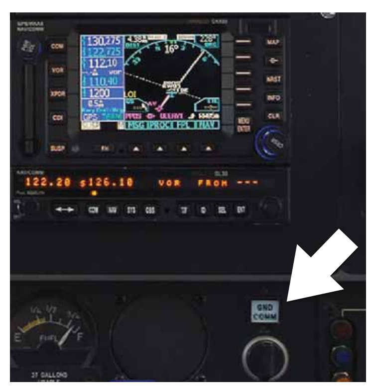
Ground power switches power up the avionics without using the master switch (which also spins up instrument gyros, etc). They're relatively inexpensive, they help conserve battery power, and—if the alternative is letting the engine run—they can save a lot of money over time.

Time is money, so the old saying goes, and nowhere is that more true than in aviation. None of us like to waste time on the ground, but don't get impatient: Get your clearance and program the route into the GPS before you taxi out (and preferably before starting the engine). In a moving aircraft, all the button pushing and knob twisting of flight plan entry is just too much of a distraction. More than one runway incursion has been caused by a "heads-down" pilot preoccupied with the GPS.