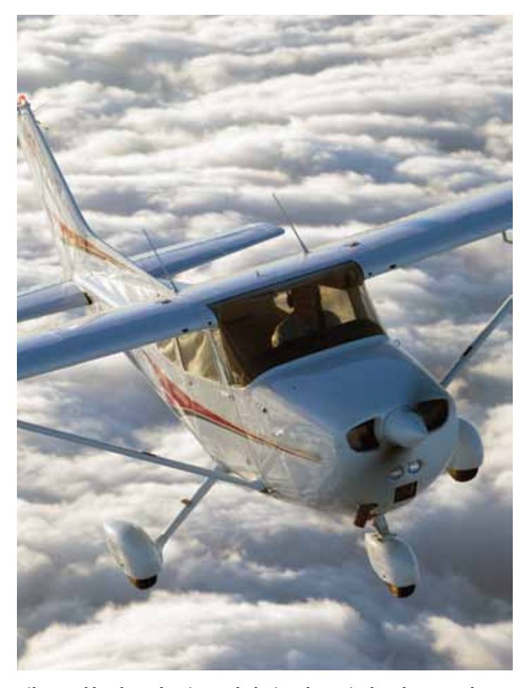
Pilot workload reaches its peak during the arrival and approach phases of flight. This is when it's most critical to be proficient with the GPS.

What if ATC tells you to hold at a navaid or waypoint? Functionality and terminology vary somewhat from receiver to receiver, but in most cases you have to manually switch the receiver to "suspend" mode. This temporarily interrupts the flight plan, so the receiver doesn't autosequence to the next waypoint. Then you can select OBS (omni-bearing selector) mode: This allows the GPS to behave like a VOR receiver. Once you're in OBS mode, you use the OBS knob on the external CDI to select the inbound radial for the hold. After that, the CDI will provide course guidance with a To or From readout, just like a VOR. On the last trip around the holding pattern, pressing "Suspend" again tells the receiver to start autosequencing again.